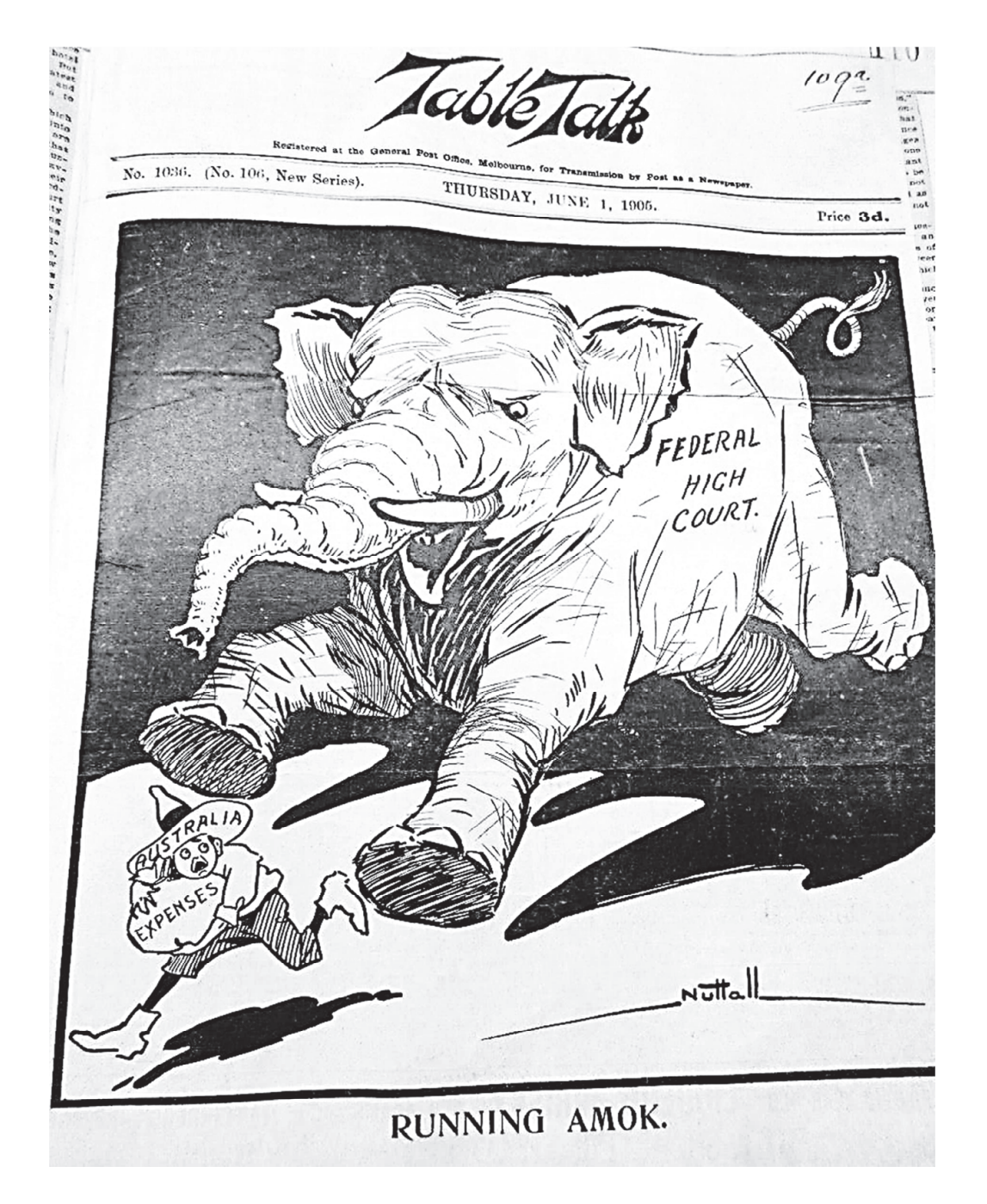
Illustration 2: Charles Nuttall, 'Running Amok', TableTalk (Melbourne), 1 June 1905